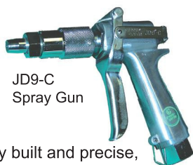
JD9-C Spray Gun

Ruggedly built and precise, the JD9-C applies solutions in a fine spray to a precise stream. With a host of optional nozzles and feeding attachments, the JD9-C is a versatile and indispensable part of your spray equipment.