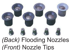
(Back) Flooding Nozzles (Front) Nozzle Tips