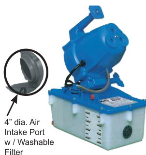
4" dia. Air Intake Port w / Washable Filter

(Right) Dyna-Fog Hurricane Electric Portable Aerosol Applicator. Dispenses both oil and water-based products. Three precision nozzles provide greater output capacity. Adjustable between 0-5 GPH, and can handle both large and small areas.