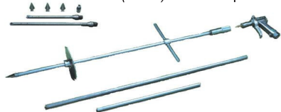
Root Feeder Attachments