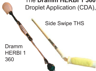
Dramm HERBI 1 360