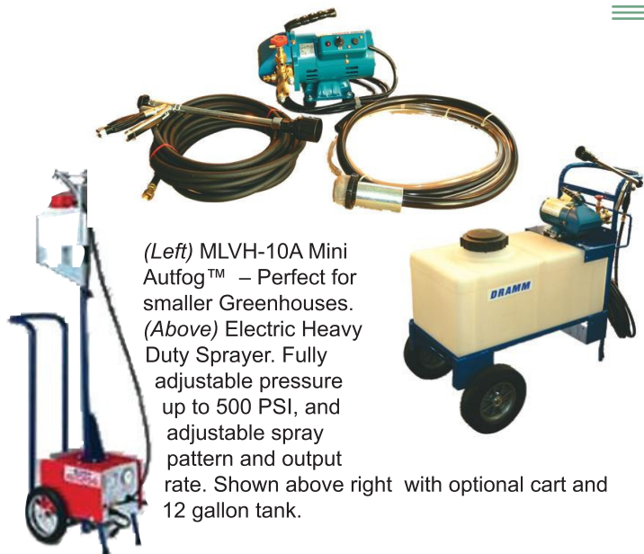
(Left) MLVH-10A Mini AutoFog™ – Perfect for smaller Greenhouses. (Above) Electric Heavy Duty Sprayer. Fully adjustable pressure up to 500 PSI, and adjustable spray pattern and output rate. Shown above right with optional cart and 12 gallon tank.