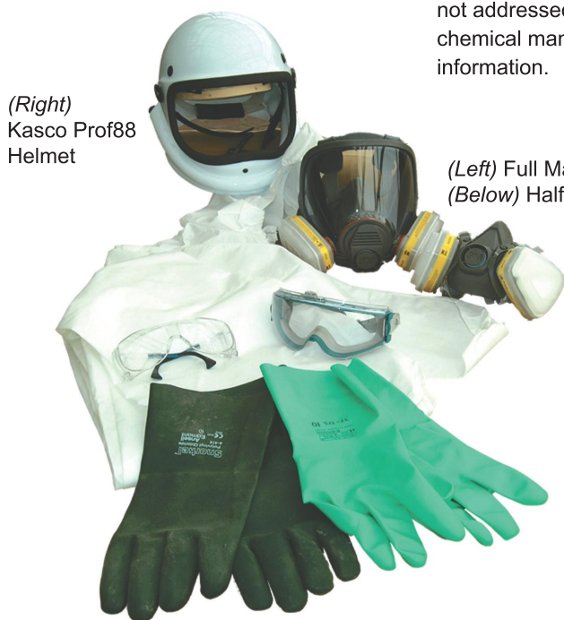
(Right) Kasco Prof88 Helmet

The Professional Gardener supports care and safety in the workplace. For the protection of the applicator and surrounding crops, precautions must be taken when applying any chemical or fertilizer. Always read the information and instruction provided on the container label. If a specific crop or concern is not addressed, contact the chemical manufacturer for more information.